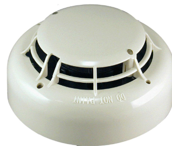
SD505-PHOTO Smoke Detector

Ambient Temperature: 32°F to 120°F (0°C to 49°C)